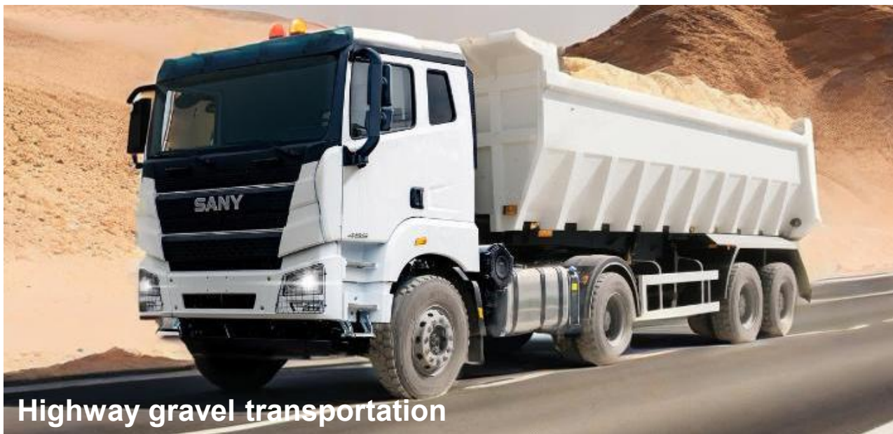
Highway gravel transportation