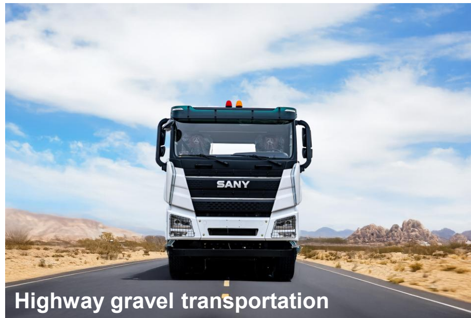
Highway gravel transportation