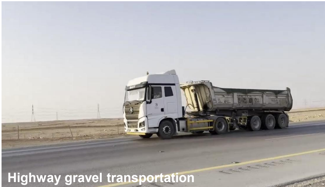
Highway gravel transportation