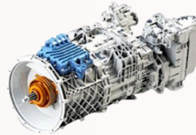
FAST gear transmission