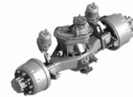
FANGSHENG / HANDE axle