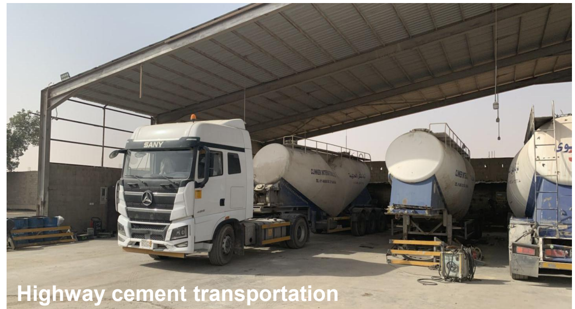
Highway cement transportation